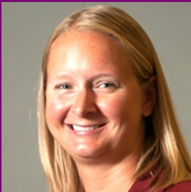
Running for Membership Coordinator

I am currently the Aquatics Supervisor for the City of Palm Bay, and have lived on the Space Coast for 9 years. I am originally from Ohio and began swimming when I was 5 years old and really have never left. I swam competitively through college and swam my first Masters meet in 2005. I have coached at the college level for The Ohio State University, Florida International University, St. Francis University and my last stop was at Florida Institute of Technology, where I started their program. I am now a high school coach for Palm Bay High School. I currently swim for Sarasota Sharks, but before that I was a founding member of the Brevard Blue Whales. Away from the pool, I enjoy spending time with my 3 dogs, all long haired dachshunds, reading and being a brand ambassador for an up and coming athleisure clothing line.