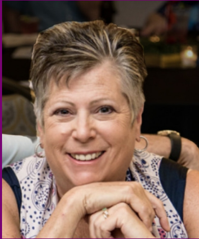
Running for Membership Coordinator