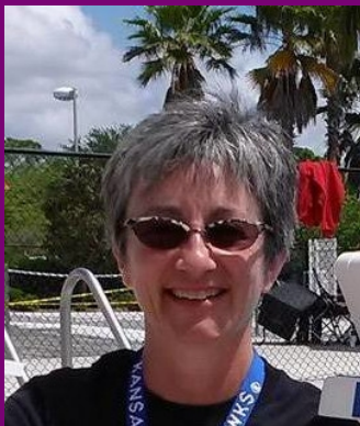
Running for Sanctions Chair

I've been a Masters swimmer since 1987. I quickly got involved with my LMSC (Missouri Valley) and served as their Registrar for 20 years and Treasurer for 15 years. I also served as a meet director for many swim meets in the Kansas City area. I started attending the USMS National Convention in 1993 and served on several committees, as chair of the Registration Committee, and on the USMS Board of Directors.