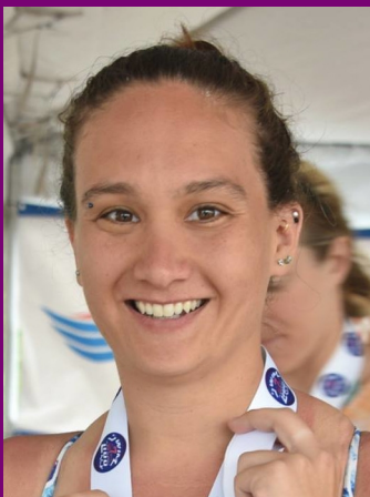
Running for Secretary