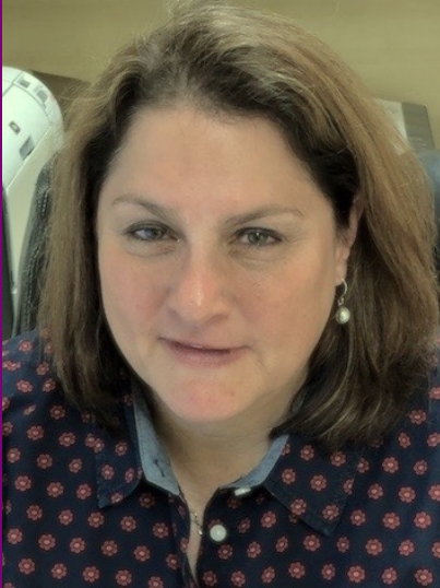
Running for Treasurer

I swam on our local swim team in upstate NY from age 7-14. I continued my passion for swimming by coaching various age-group teams, including the Ann Arbor youth Swim Team during College and after that. After a 33-year taper, I returned to swimming and joined the Sarasota Sharks Masters team in 2006.