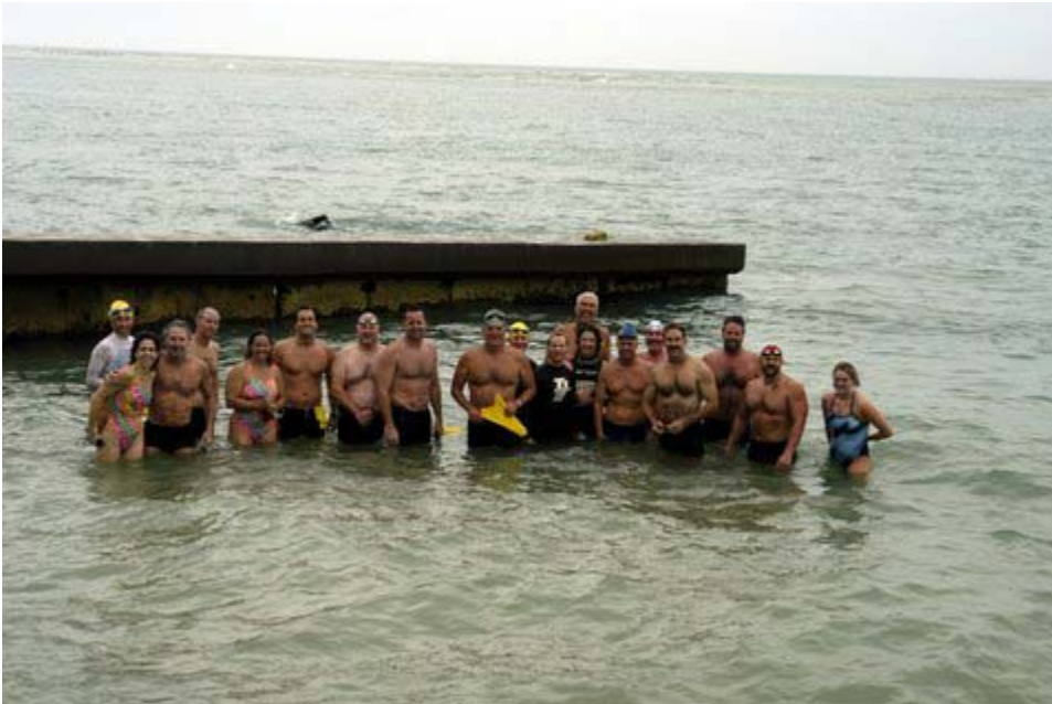
Annual Big Pass Swim January 1, 2007