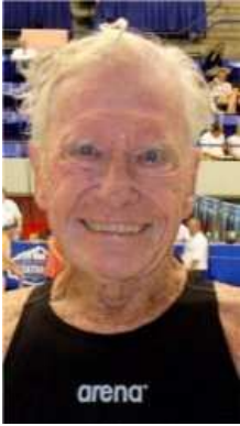
ASCA Level IV Coach 2004 IMSHOF Inductee 2010 FL LMSC Coach of the Year