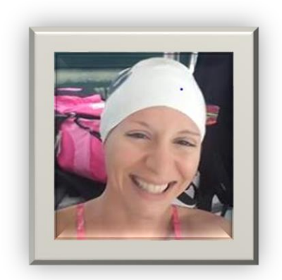
St. Pete Masters <a href="http://stpetemasters.org/">http://stpetemasters.org/</a>